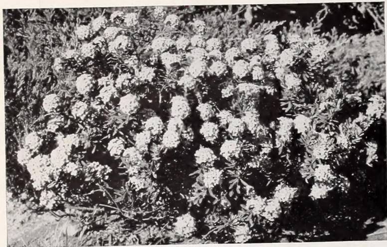
DAPHNE CNEORUM— GARLAND FLOWER